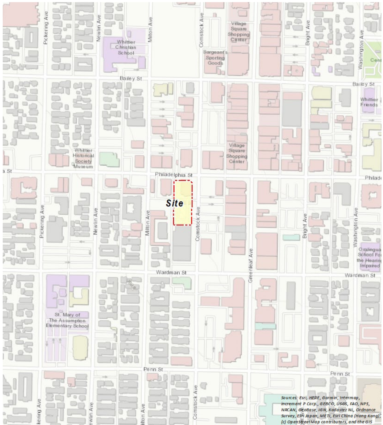
EXHIBIT 1-A: LOCATION MAP