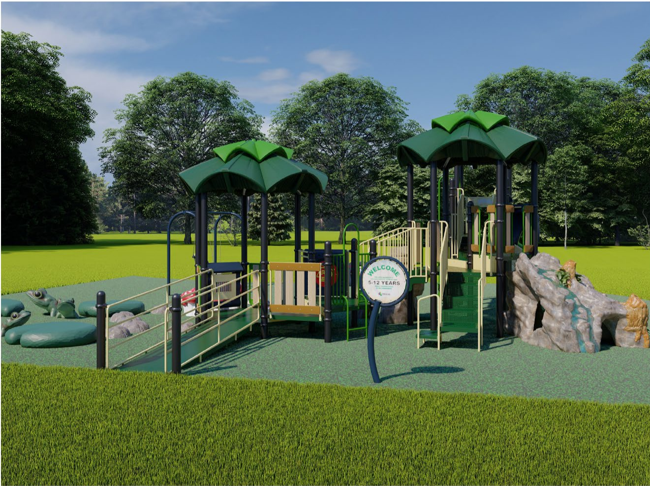
Play Equipment Rendering