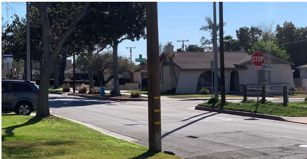
Exhibit 1 - The Corner of Palm Ave & Howard (Greenwood Trail) Notice the paint has worn off 80%

Hello Esteemed Whittier City Council members and the honorable Whittier PD. On Wed Jan 12th, 2022 at around 12:30PM, I was almost run over by a lady in her 50s driving a black Honda Pilot mini-SUV southbound on Palm Ave. The situation was that I was out on my lunchtime jog, running west-bound on the Greenwood Trail, I always stop at all corners (even if there is a traffic light) and I check for hazards including cars motorcycles bikes, etc. The lady did stop at the stop sign and when I confirmed her wheels were fully stopped (I always look at the tires and wheels of vehicles) I proceeded to job into the intersection (I don't typically walk) as I was about 60% of the way. The lady proceeded to accelerate at a rapid pace away from the stop sign, and caused me to pull evasive maneuvers to prevent her taking me under her car (which was to basically catapult using her cards hood for leverage to help me clear her vehicle) I did not fall but a neighbor saw me and asked if I was ok. The driver, she did not stop or check on me at all, and when I pulled my phone out (rather slowly I have to admit) I did not get a chance to take a photo of her rear license plate. Anyhow, I am ok. There was a witness to this though, if you need someone to collaborate the story I am telling you is truthful and accurate. That being said this enlightened me to bring up many points to you