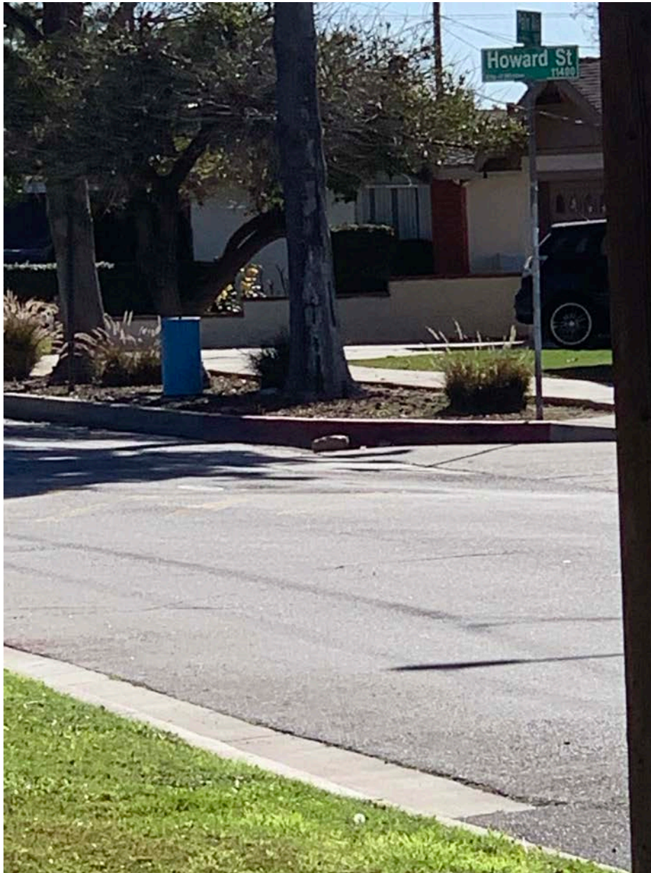
Exhibit 4 — Deteriorated Crosswalk Paint making almost illegible to read.