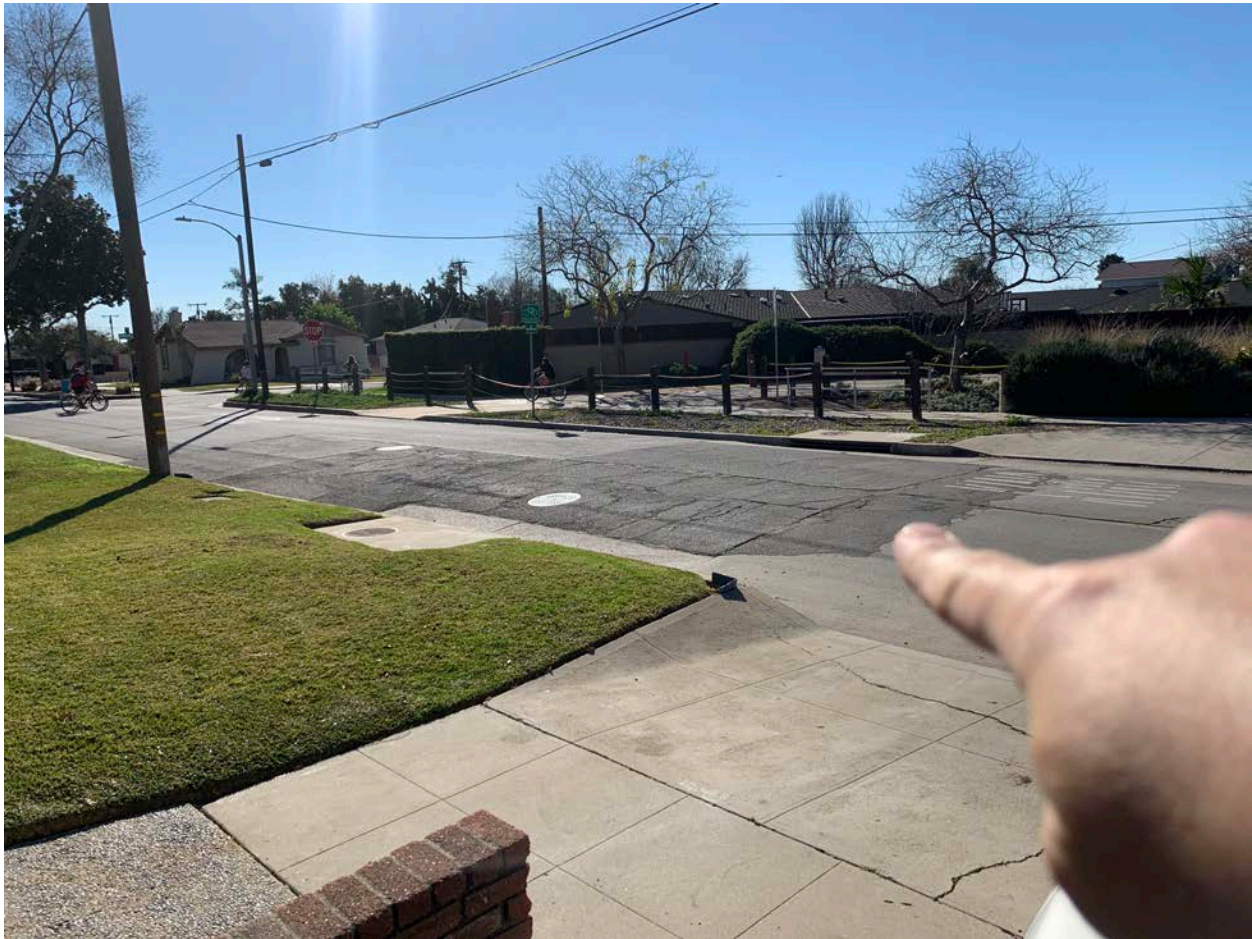
Exhibit 3 -- Photo of proposed speedbump to slow cars down and to remind them there is an upcoming pedestrian crosswalk that is rather busy (the trail)

3) Consider installing speed bumps at this intersection : After discussing my experience with the neighbors on palm (we have a group text chat) someone mentioned “speed bumps are long over due” . I thought this was a great idea and have included a photo you can submit as a suggestion of the location for the speed bump (s) please see exhibit 3 below , my finger is pointing at where the speed bump should be or could be located at for southbound traffic.