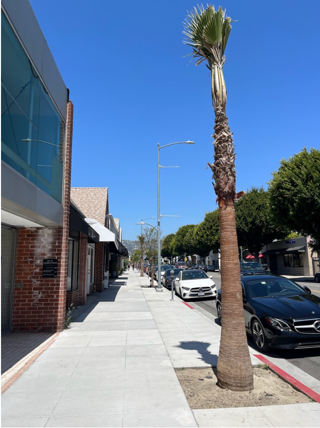
BEVERLY HILLS: View of new sidewalk and replacement trees on one side of Robertson Blvd. compared with mature ficus trees on the other side of the street (picture taken April 27, 2024).

Council Meeting: _____ Agenda Item No: _____