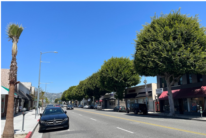
BEVERLY HILLS: Ficus trees were removed in Feb. 2023 on one side of Robertson Blvd. in a one block area, and replaced with small palm and crepe myrtle trees as part of a sidewalk renovation project. Citizens sued to stop removal of ficus trees on the other side of the street. Litigation is ongoing 15 months later... (picture taken April 27, 2024).