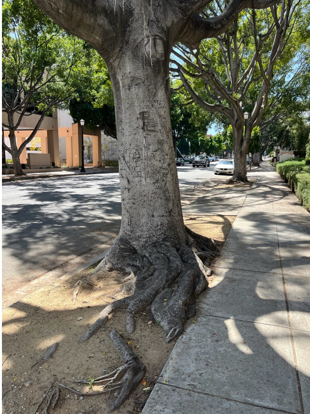
PASADENA: Ficus tree roots without surrounding barriers (picture taken April 27, 2024).