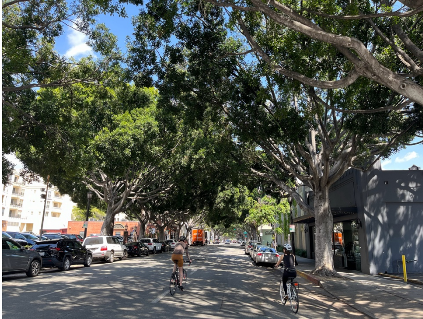
PASADENA: Under Green St. ficus canopy (picture taken April 27, 2024)