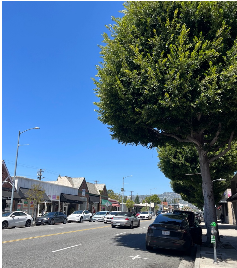
BEVERLY HILLS: Another view of Robertson Blvd. showing immature trees on one side of renovated block, compared with mature ficus trees on other side (picture taken April 27, 2024).