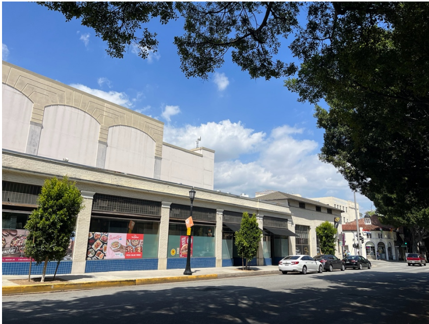
PASADENA: Ficus trees planted in Pasadena in March 2023 to fill in bare spaces in the canopy (picture taken April 27, 2024).