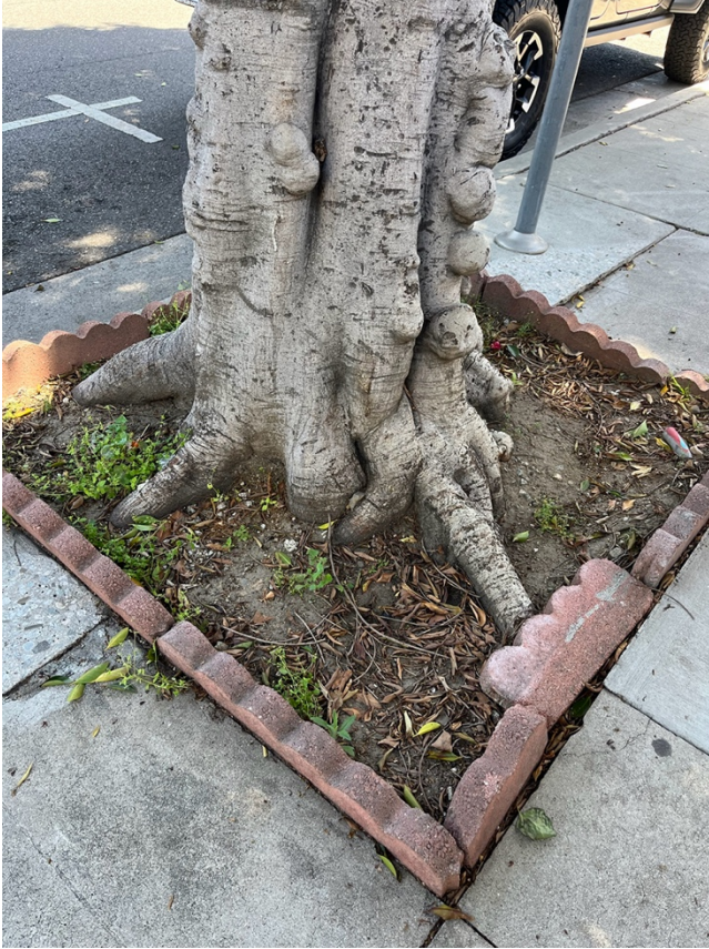
BEVERLY HILLS: Unattractive concrete barriers surround ficus trees. (picture taken April 27, 2024)