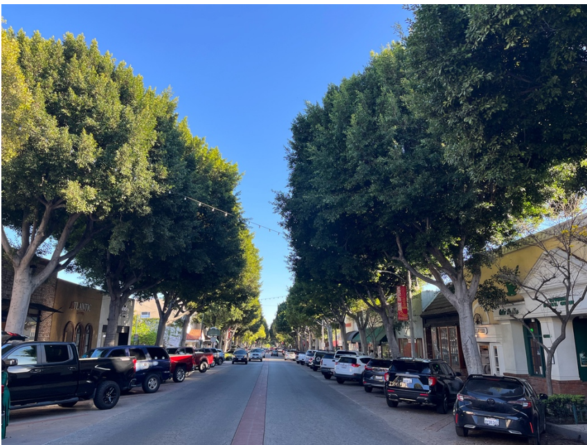
WHITTIER: iconic canopy of mature ficus trees on Greenleaf AV (picture taken April 27, 2024).