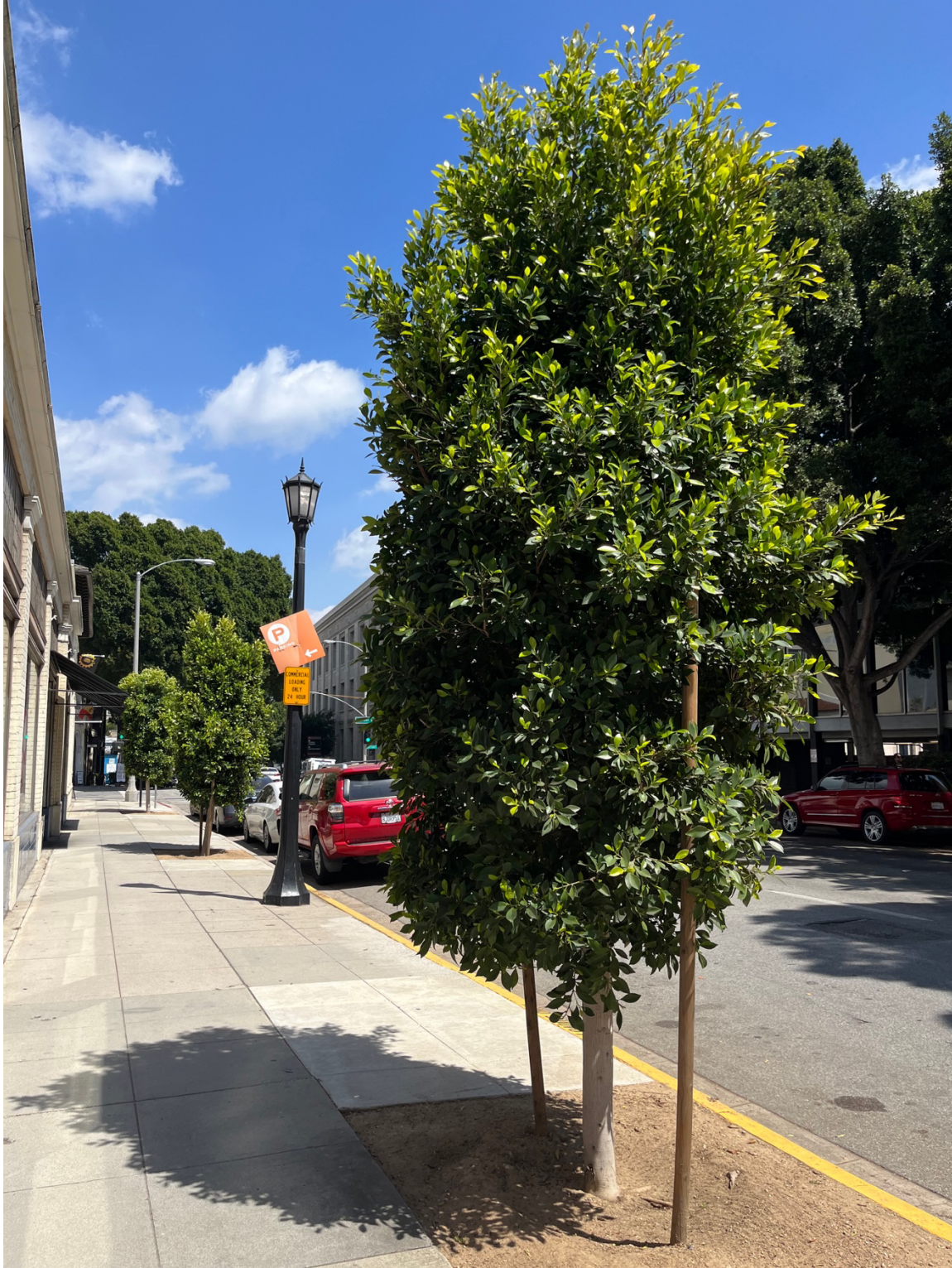
New ficus trees planted in Pasadena on Arbor Day in March 2023