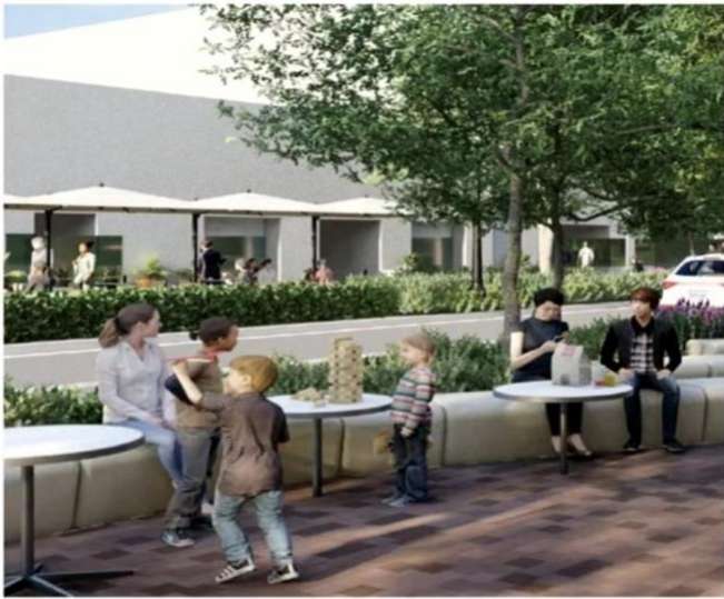
swa Greenleaf Promenade Whittier, CA

which was supported by 86% of the local community and Uptown business owners but was jettisoned in favor of the current 2024 Plan which will cut down and destroy all 108 Ficus trees in Uptown (see visualization photo below). PLEASE SAVE OUR TREES AND SHADE CANOPY.