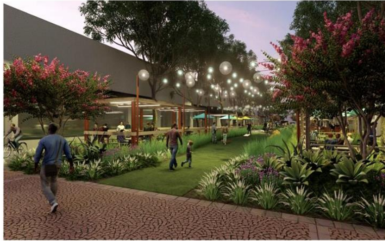
swa Consulting Studies for Nonprofit District of Oakland Avenue Whittier, California