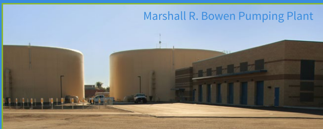
Marshall R. Bowen Pumping Plant

Some people, however, may be more vulnerable to contaminants in drinking water than the general population. Immuno-compromised persons such as people with cancer undergoing chemotherapy, people who have undergone organ transplants and people with HIV/AIDS or other immune system disorders, some elderly and infants can be particularly at risk from infections are among those that may be more vulnerable. These people should seek advice about drinking water from their health care providers.