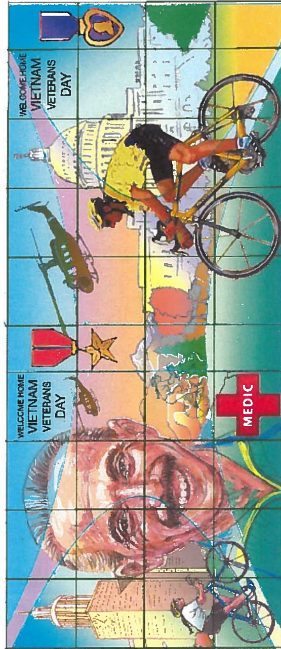
Figure 2. Stelea