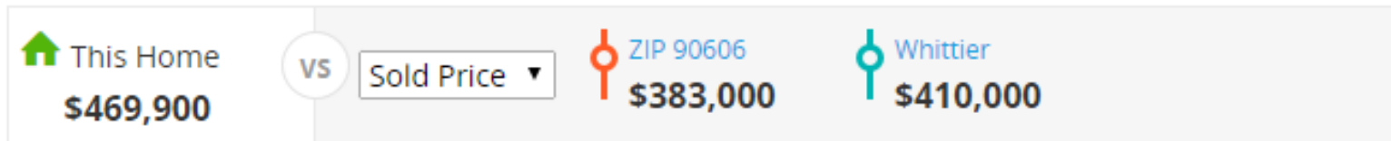
EXHIBIT B of Response to 16-26